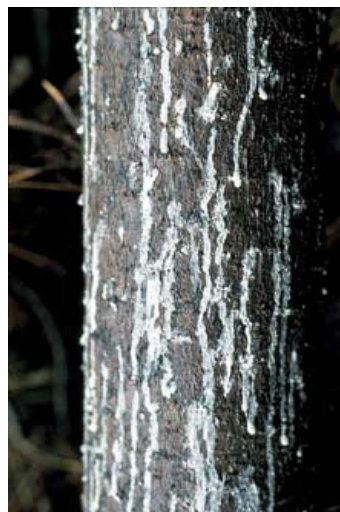
Figure 6. Resin beads and dribbles at egg-laying site.