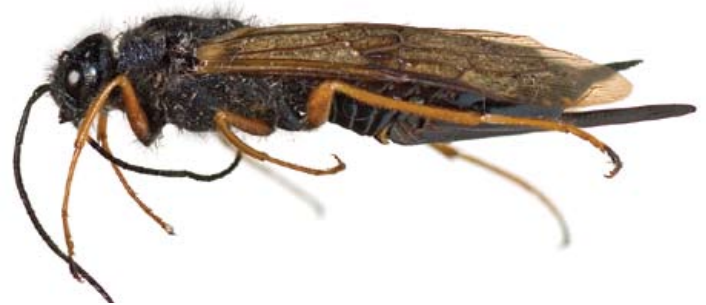
Figure 1. Sirex noctilio —adult female.

Positive identification of S. noctilio needs to be confirmed by an insect taxonomist. Therefore, collect and submit any suspect woodwasps to your county extension or state Department of Agriculture office.