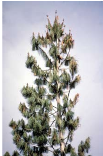
Figure 4. Green needles wilt and point straight down.

Dennis A. Haugen and Kent Loeffler (Dept. of Plant Pathology, Cornell University).