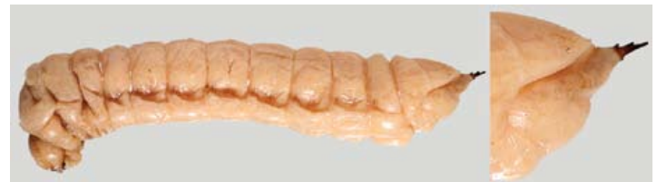
Figure 3. Sirex noctilio —larva and close-up of posterior spine.