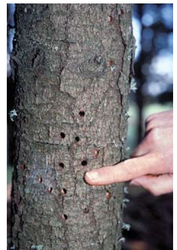
Figure 8. Round exit holes.