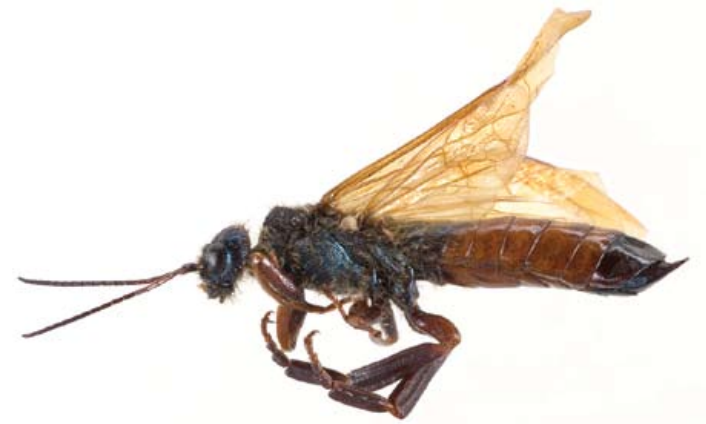
Figure 2. Sirex noctilio —adult male.