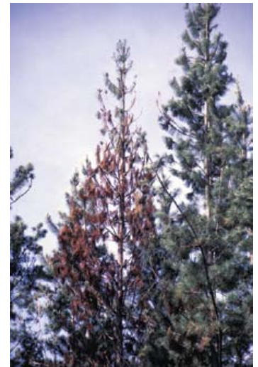
Figure 5. Needles eventually turn red.